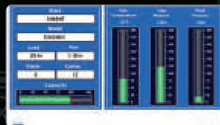
Optional Analog/Digital Screen